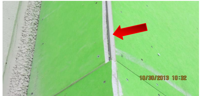
Poor Installation of the sheathing corner