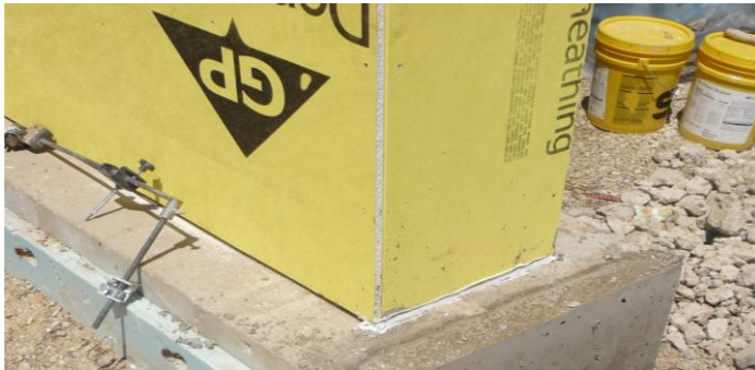
Nice Installation of the sheathing corner

This is a photo of the AVB installation at the corner (photo to the left)... As you could see, there is a gap in the AVB due to the sheathing installation.